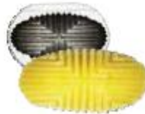
N°6 Height - 30 mm Length - 90 mm Width - 30 mm