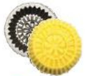
N°11 Diameter 60 mm Height 14,5 mm