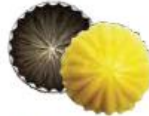
N°3 Diameter 51 mm Height 25 mm