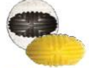
N°10 Height - 22,5 mm Length - 56 mm Width - 30 mm