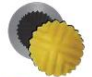
N°18 Diameter 50 mm Height 37,5 mm