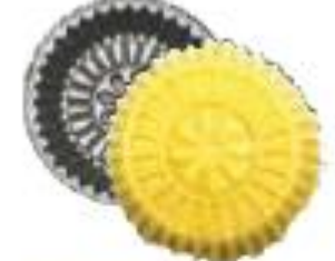
N°8 Diameter 70 mm Height 14 mm