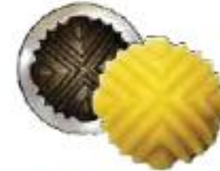
N°4 Diameter 40 mm Height 17,5 mm