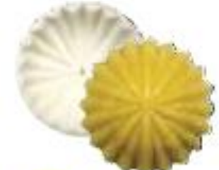
N°5 Diameter 75 mm Height 27 mm