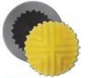
N°19 Diameter 40 mm Height 32,5 mm