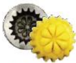
N°1 Diameter 44 mm Height 22 mm