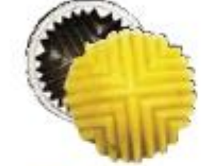
N°9 Diameter 60 mm Height 30 mm