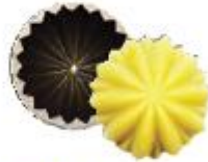
N°2 Diameter 54 mm Height 24 mm