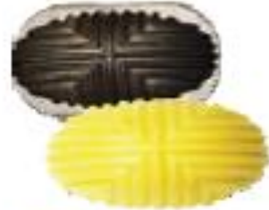
N°7 Height - 25,5 mm Length - 74 mm Width - 37 mm