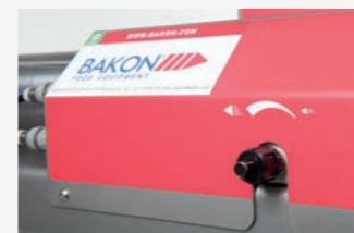
C The working table is manually adjustable (per 5 mm.)