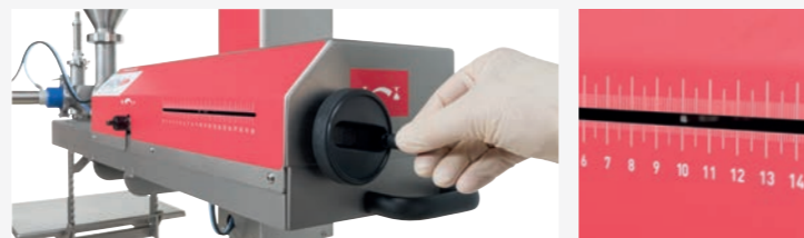
B Dosing speed

The set volume is indicated on the scale