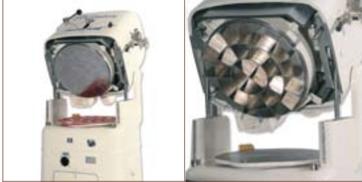
Dividing plate with dividing knives