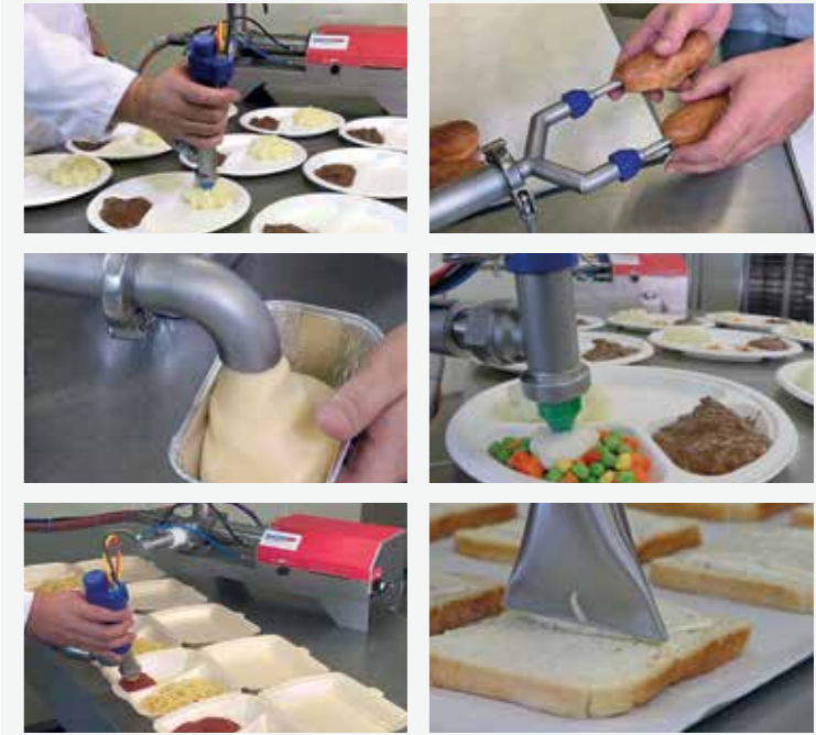
X Model with hose and gun

With this extensive and user-friendly range of BD Depositors we cover all your depositing needs and demands. These fast and powerful BD Depositing machines have been designed and developed according to today's requirements in the field of hygiene and all BD Depositors already meet the new standard of 4 bar operating pressure.