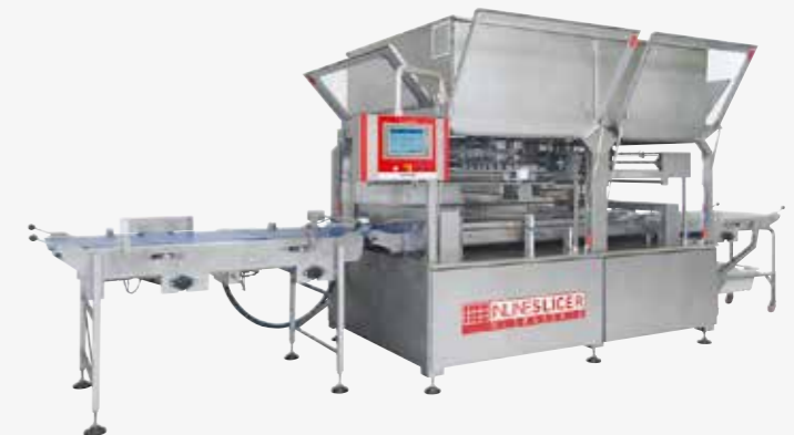
Multi station ULTRASONIC INLINE SLICER extra high production capacity